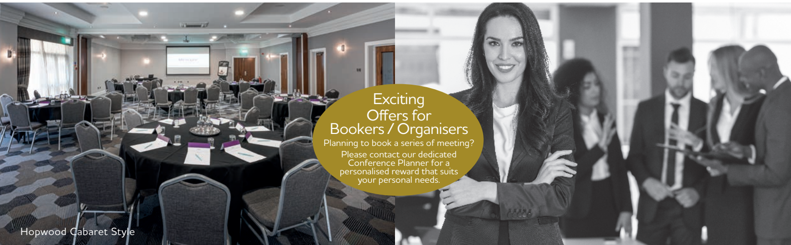
Hopwood Cabaret Style