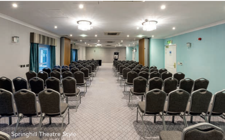
Springhill Theatre Style