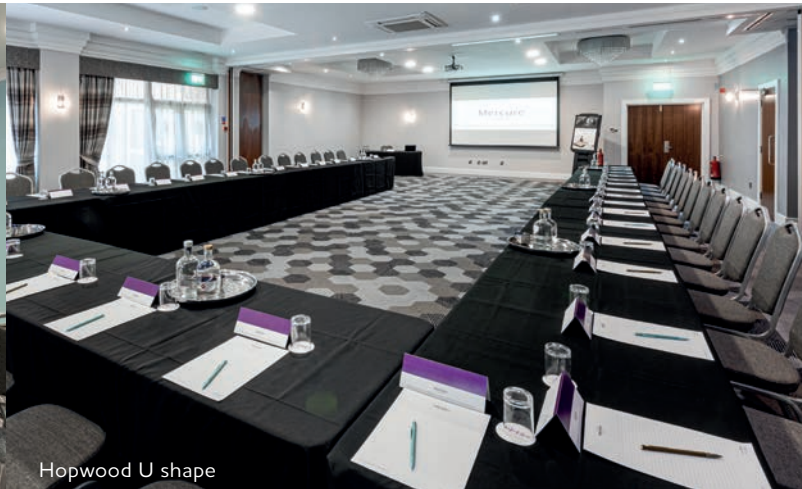
Hopwood U shape

The 4-star Mercure Manchester Norton Grange Hotel and Spa is set in tranquil countryside and its own landscaped grounds with views over the Pennine hills. Situated in peaceful countryside with views over the Pennine hills, yet only one mile from Junction 20 of the M62 and eight miles from Manchester City Centre, whether you are hosting an elaborate reception, private celebration or fully themed evening, the hotel can provide any kind of event that North Manchester requires.