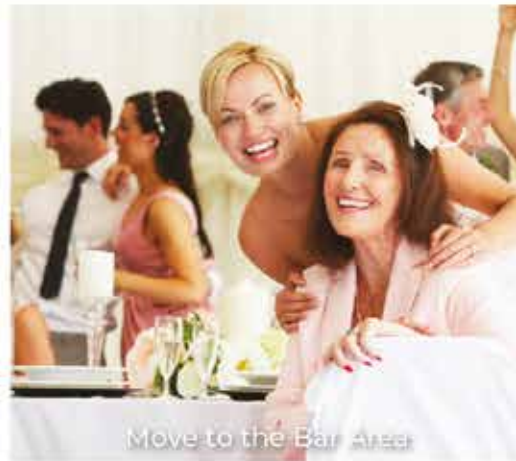
Move to the Bar Area