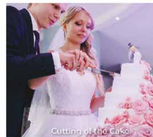
Cutting of the Cake