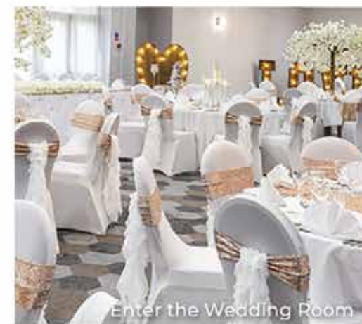
Enter the Wedding Room