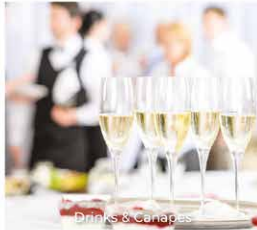
Drinks & Canapes