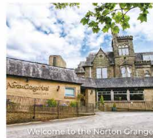
Welcome to the Norton Grange